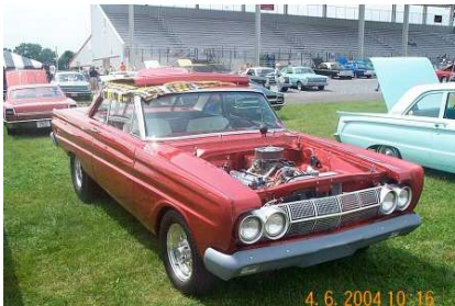
Ken Noland's 64 Pro-Street