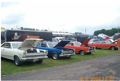
The winners: Red, White & Blue